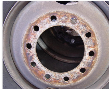
Steel Wheel performance after 3 years of service without using an Accuride Wheel-Guard