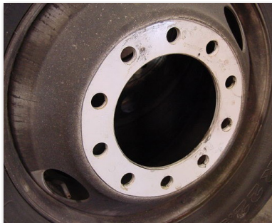
Steel Wheel performance after 3 years of service using an Accuride Wheel-Guard