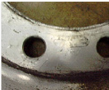
Aluminum Wheel performance after 3 years of service using an Accuride Wheel-Guard