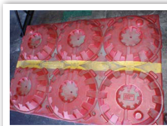
Aluminum Wheel Tray