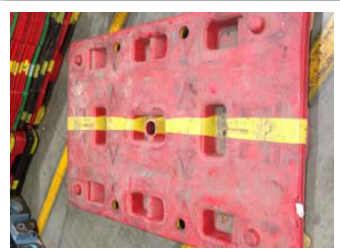
Aluminum Wheel Base

Your only single source for industry-leading wheel end solutions.