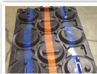
Steel Wheel Tray