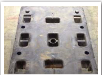
Steel Wheel Base