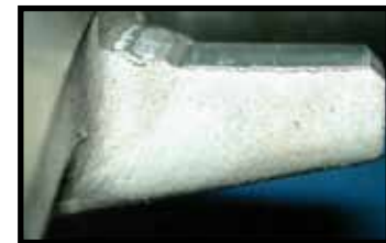
Damage to aluminum hub pilots will not allow the drum to seat properly.